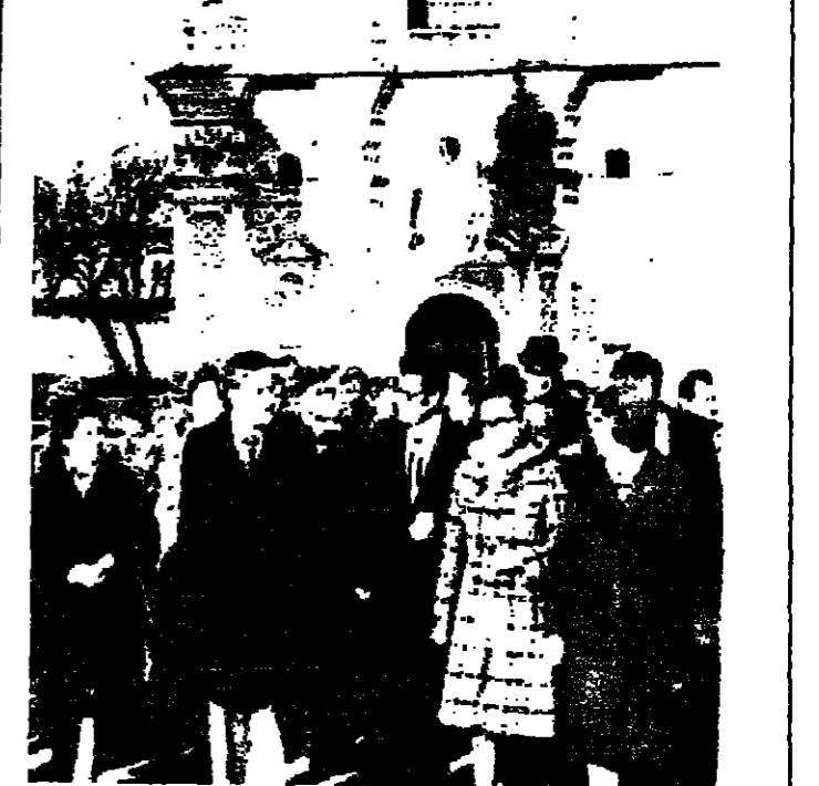
SIGHTSEEING TOUR -- Syrian President Hafez Assad (second from left) tours the city of Kiev in the Soviet Union Wednesday.

In Moscow, the Soviet Union today issued a fresh denial of Soviet, Cuban or Angolan involvement in the fighting in Zaire, and denounced Western assistance to the government of President Mobutu.